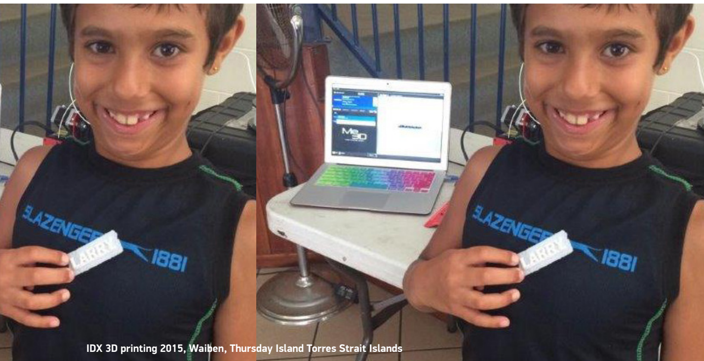
IDX 3D printing 2015, Waiben, Thursday Island Torres Strait Islands