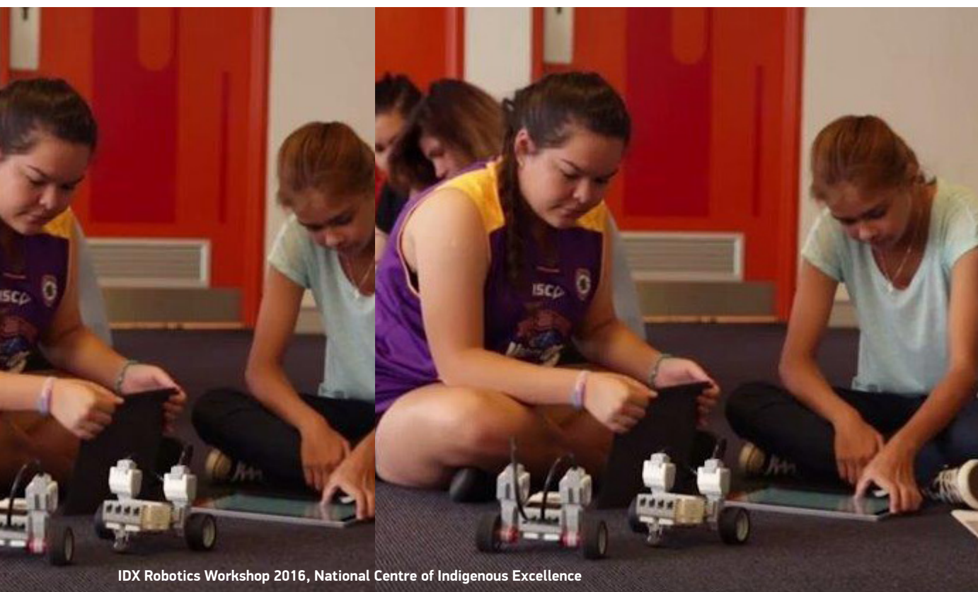
IDX Robotics Workshop 2016, National Centre of Indigenous Excellence